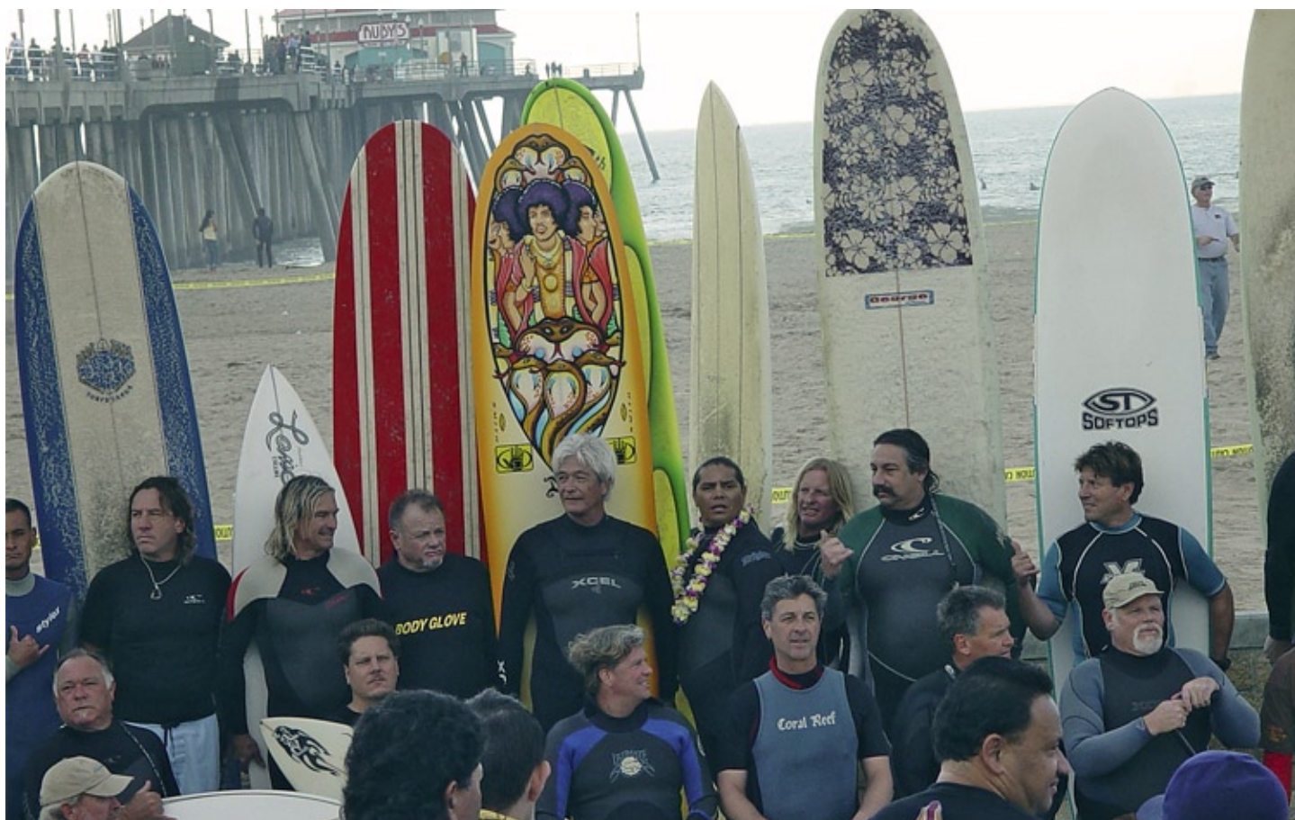
The longboard line up. Huntington Beach Pier 2005.