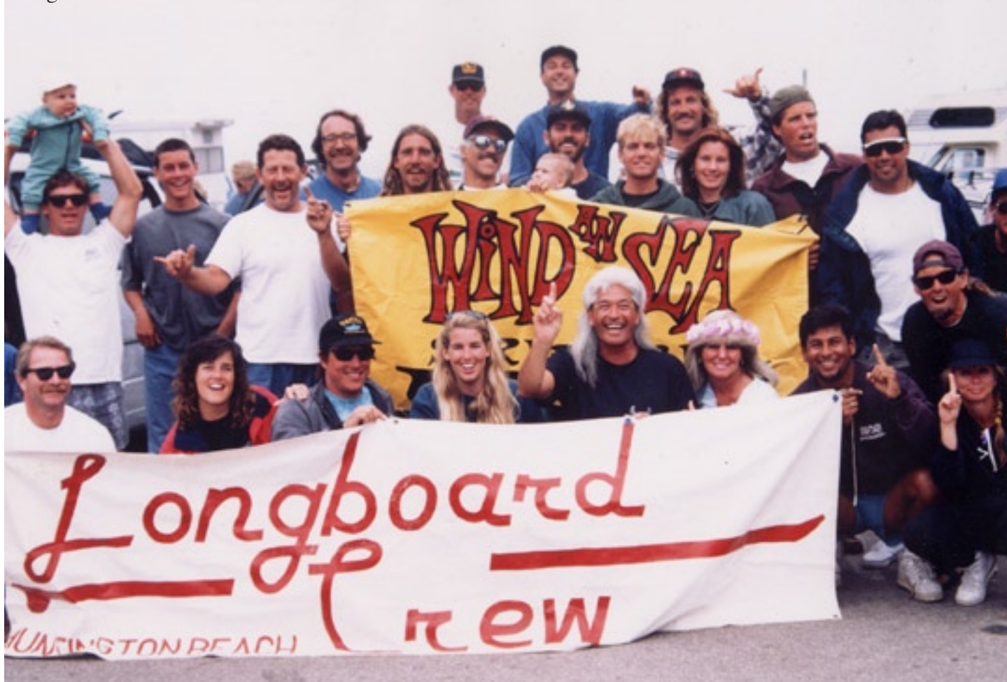
Longboard Crew Hall-of-Famers in Santa Cruz: 1992.